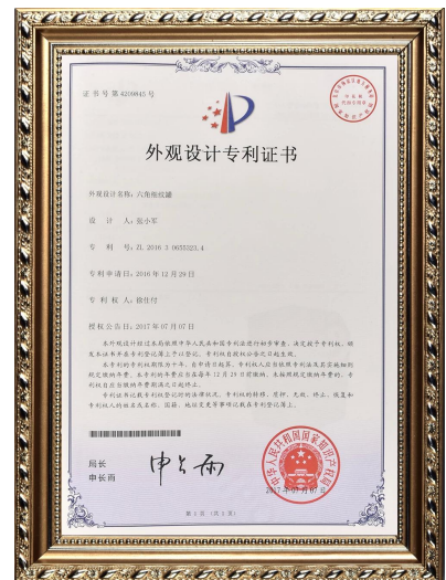
Numéro de brevet : 201630655323.4