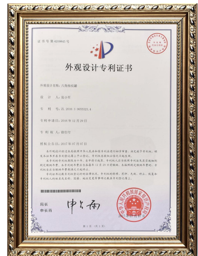
Numéro de brevet: 201630655323.4