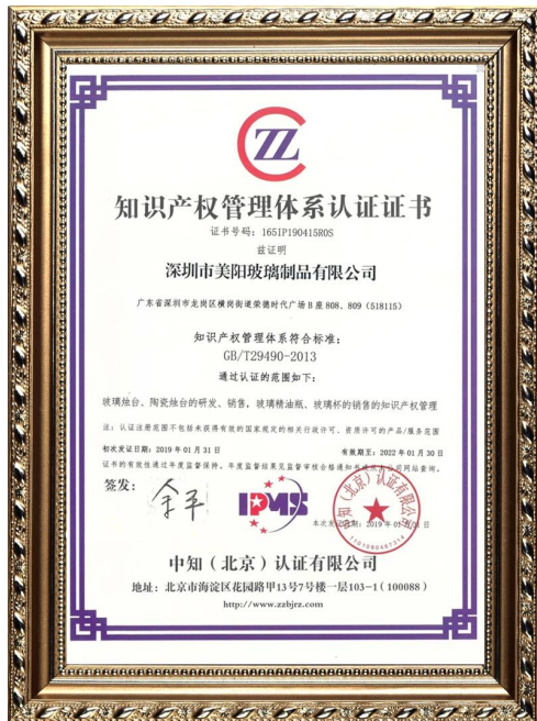
Propriété intellectuelle des entreprises