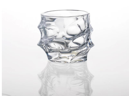
decoration glass candle holder