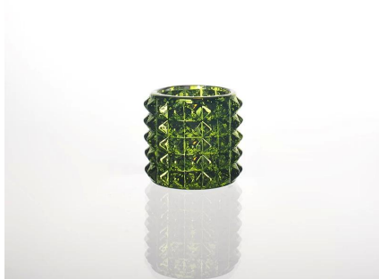
colored glass candle cup