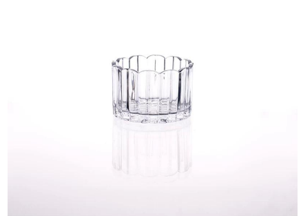
clear candlestick glass