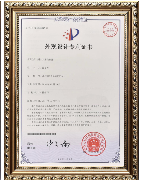
Numéro de brevet: 20163065523.4