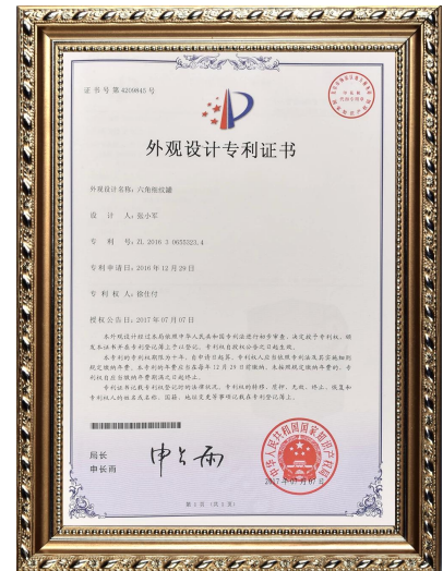
Numéro de brevet: 201630655323.4