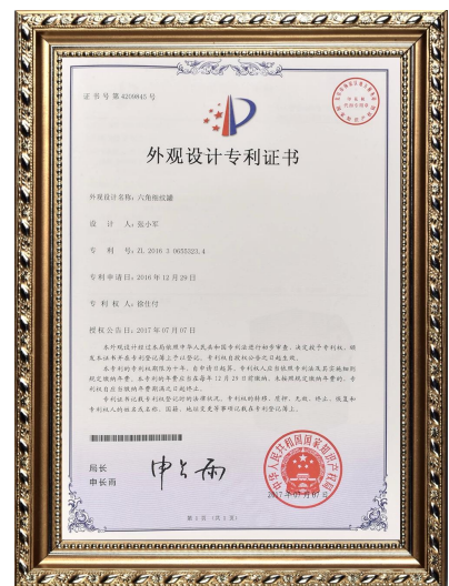
Numéro de brevet : 201630655323.4