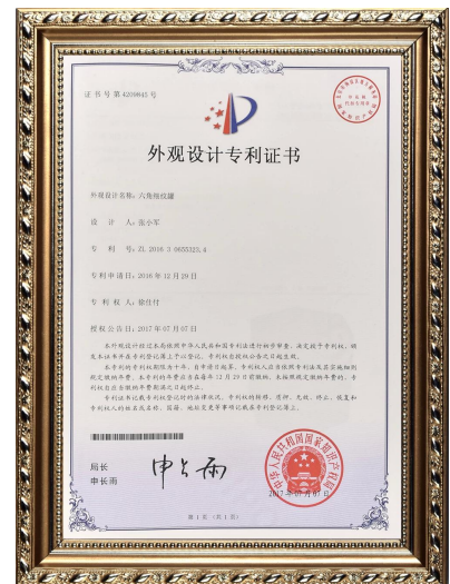
N ° de brevet: 20163065532.4