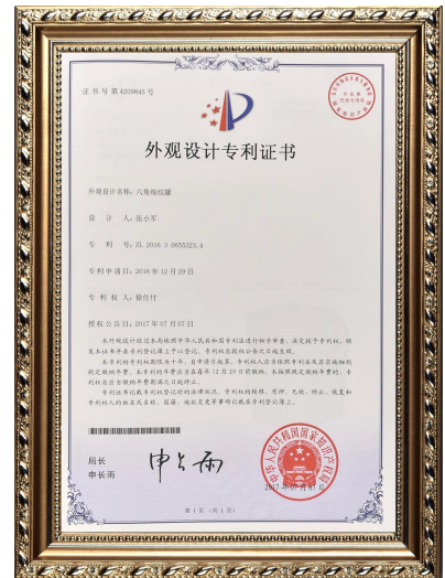
Número de patente: 20163065532.4