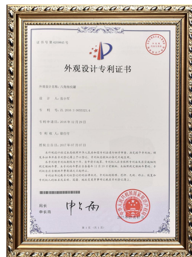
Número de patente: 201630655323.4