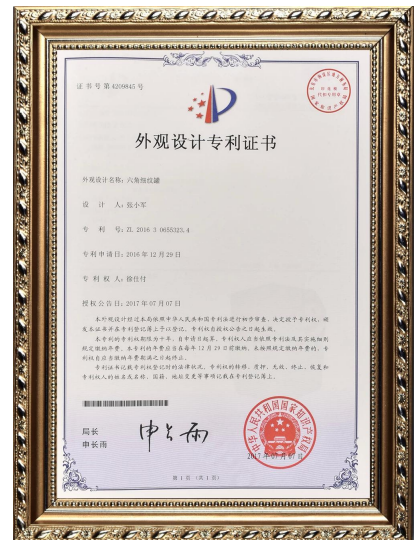
Patente n. 2.20163065523.4