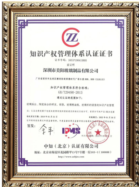
propiedad intelectual empresarial