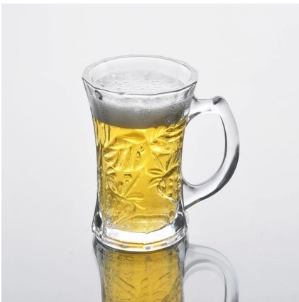
light white glass mug