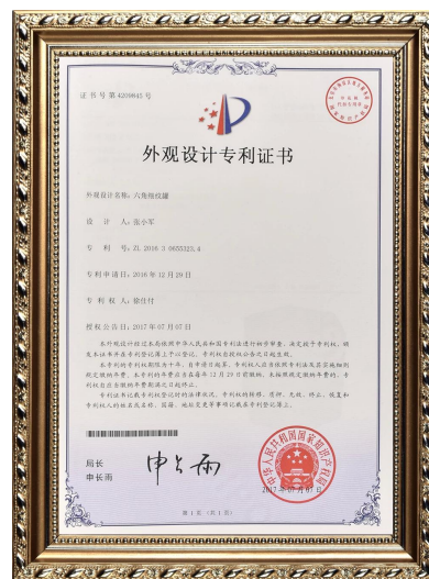
Número de patente: 201630655323.4