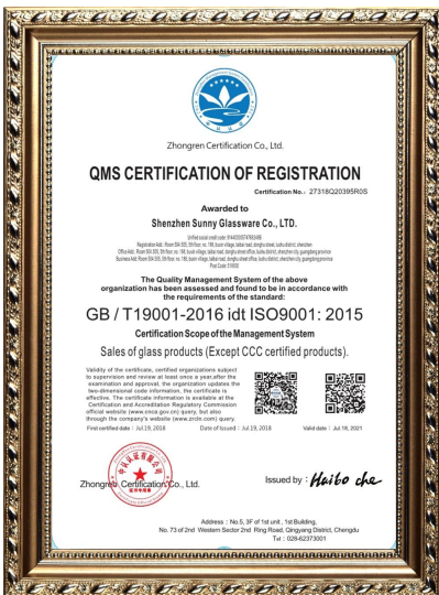
ISO 9001: 2015