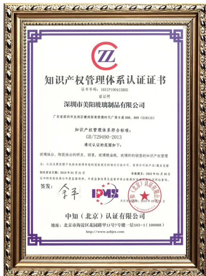
Propiedad intelectual de la empresa