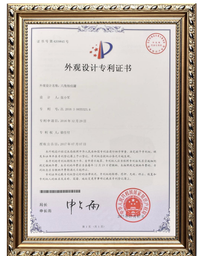
Patente no.: 201630655323.4