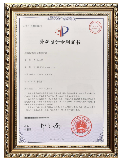
Número de patente: 201630655323.4