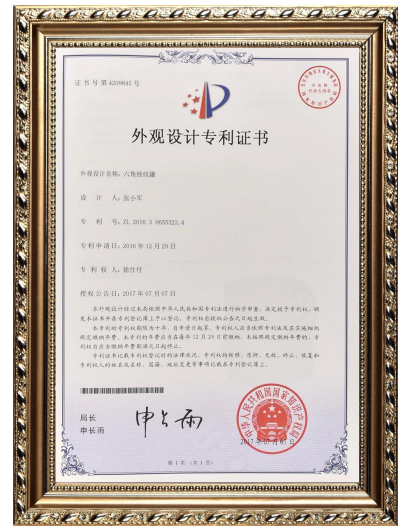
Número de patente: 20163065532.4