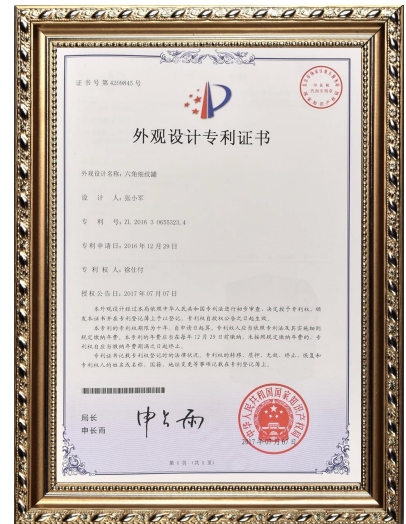
Número de patente: 201630655323.4