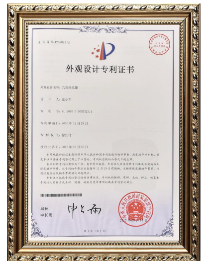
Patente no.: 20163065532.4