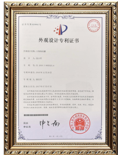
Número de patente: 20163065532.4