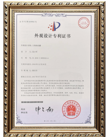
Número de patente: 201630655323.4