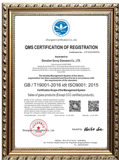
Norma ISO 9001:2015