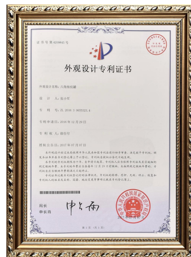
Número de patente: 201630655323.4