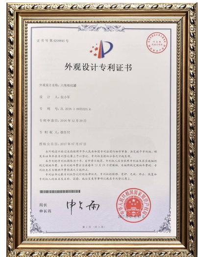
Número de patente: 201630655323.4