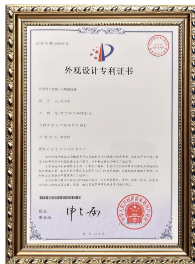
Número de patente: 201630655323.4