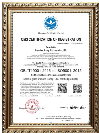
Norma ISO 9001:2015