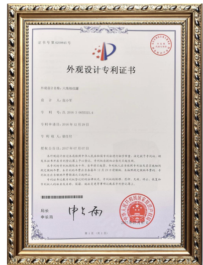
Patente n.: 201.630.655.323.4