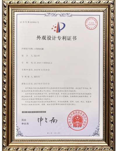
Número de patente: 201630655323.4