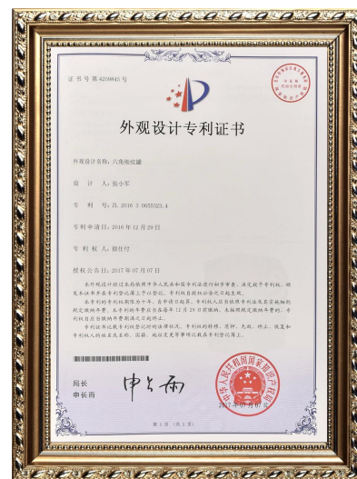
Número de patente: 201630655323.4