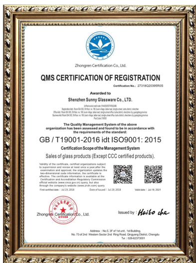
Norma ISO 9001:2015