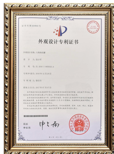
Número de patente: 201630655323.4