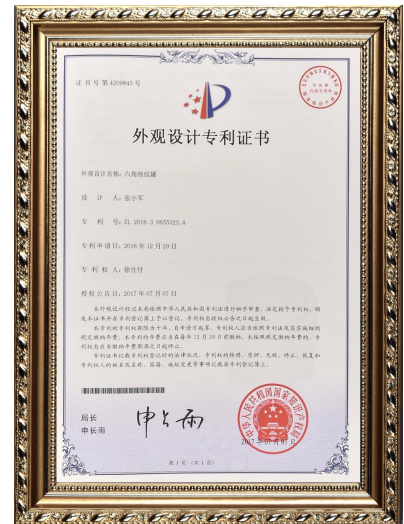
Patente no.: 201630655323.4