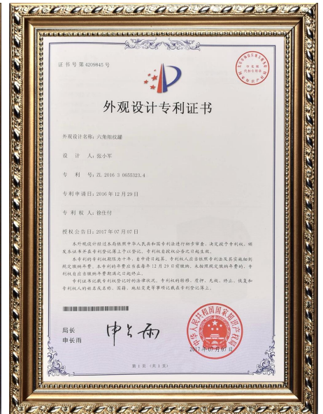
Número de patente: 201630655323.4