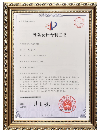
Número de patente: 201630655323.4