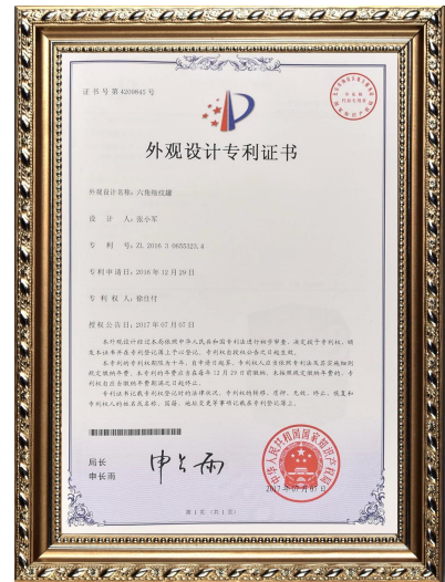
Número de patente: 201630655323.4