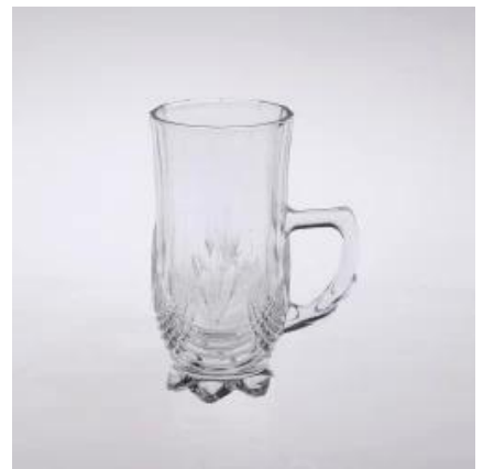
wholesale glass mug