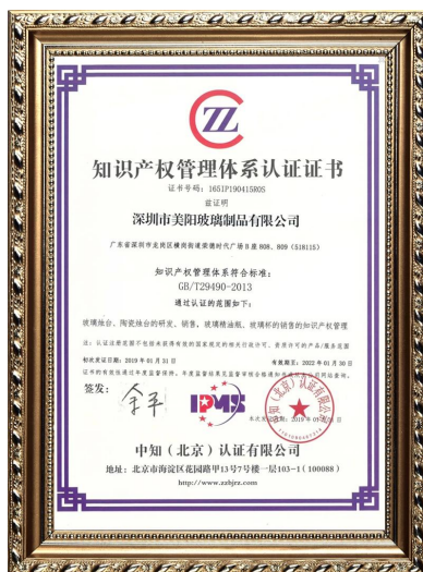
Propiedades intelectuales de la empresa