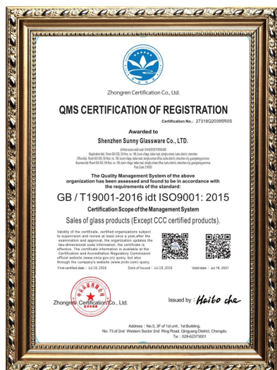
Norma ISO 9001:2015