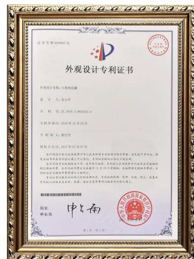
Número de patente: 201630655323.4