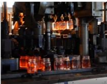
The ranks of machine