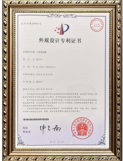
Número de patente: 20163065532.4