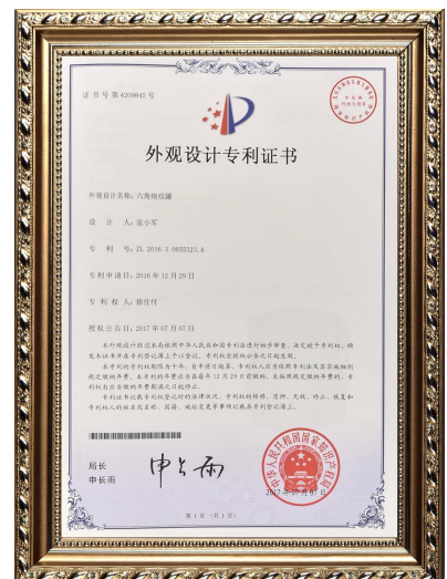
Número de patente: 201630655323.4