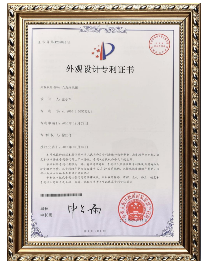
Patent Nr.: 201630655323.4