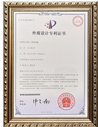
Patent Nr.: 201630655323.4