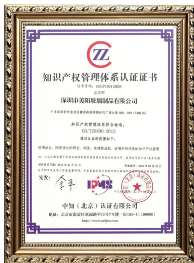
Geistiges Eigentum von Unternehmen