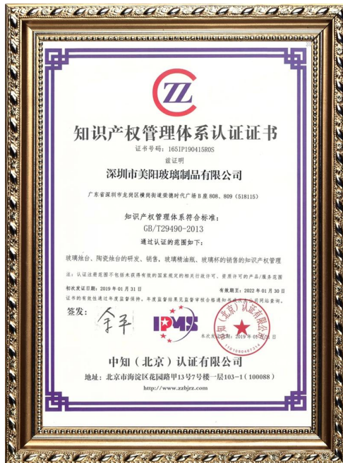
Geistiges Eigentum von Unternehmen