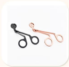
Wick Trimmer Cutter

. Dekoratives Abendessen in der Bar oder Bar