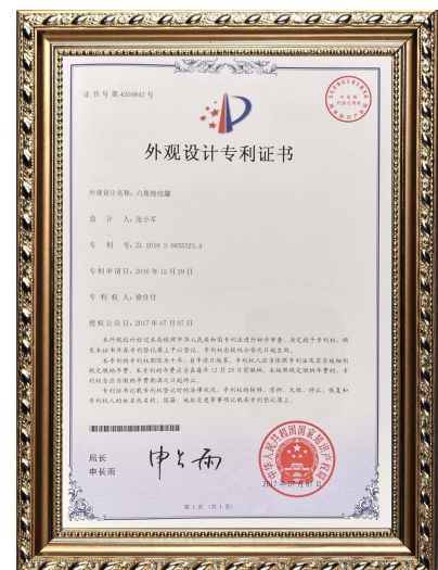
Patent Nr.: 201630655323.4