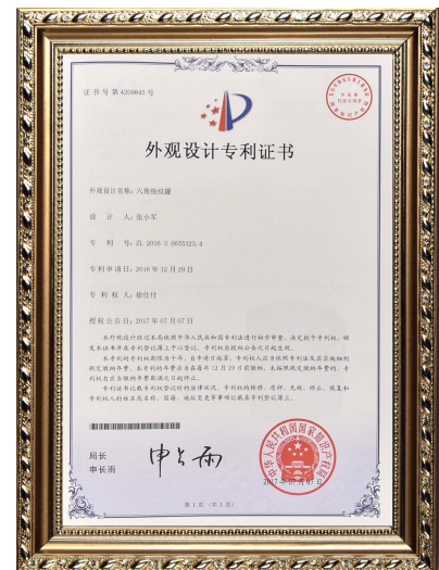
Patent Nr.: 201630655323.4