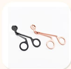
Wick Trimmer Cutter

. Dekoratives Abendessen in der Bar oder Bar