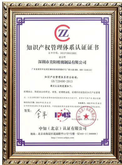
Intellektuelle Eigenschaften von Unternehmen