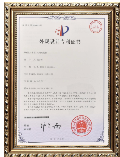
Patent-Nr. : 201.630.655.323,4