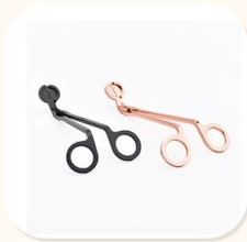
Wick Trimmer Cutter

. Dekoratives Abendessen in der Bar oder Bar